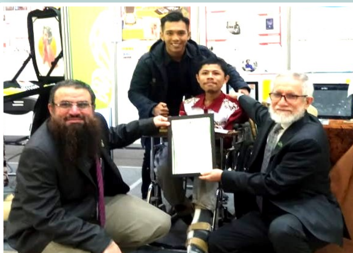
Receiving a special award from King Abdul Aziz University, Saudi Arabia.

"I am very grateful for the help and financial support I have received from the Rehabilim Trust because it's allowed me to continue my studies," he said.