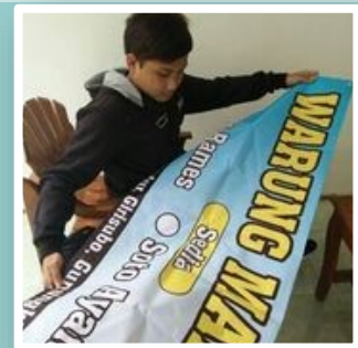
Bagas with banner design