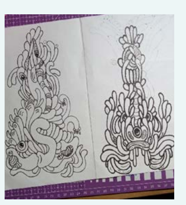
Edi's design for his assignment work plan

curriculum with various learning methods, as well as what are the supporting and inhibiting factors in implementing the Pancasila learning profile in Islamic religious education learning.